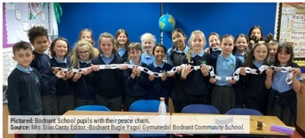
Pictured: Bodnant School pupils with their peace chain.

This month, we have launched our Picture News 'Let's Spread Peace' campaign. The campaign aims to spread peace by asking you to make your very own peace chain, with each link in the chain representing an action you feel will help to spread peace far and wide! In the past few weeks, you have amazed us by sending in photos of your fantastic creations! We believe that small acts of kindness help us spread peace in our communities and homes and can make a real difference. So, we have absolutely loved seeing what you have been making so far and hope to see more.