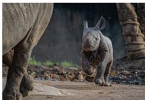
Pictured: Eastern black rhino Zuri and her new calf.

Do you know any facts about rhinos? Have you ever seen a rhino?