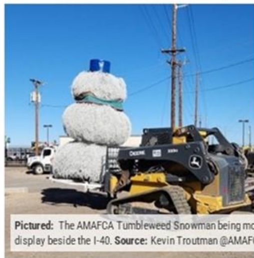
Pictured: The AMAFCA Tumbleweed Snowman being moved into position and on display beside the I-40.

Do you enjoy writing poems? Have you written one to celebrate an event?