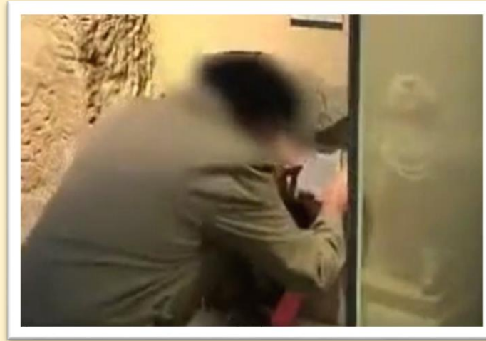
Placing his own artwork into museums undercover.

He continues to push the boundaries of his work with a variety of stunts.